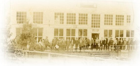
WT 272 - Whiting Lumber Company Commissary, circa 1918