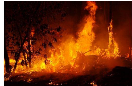
November 22, 2016 – A state of emergency was declared as the Horton wildfire consumed nearly 800 acres in Watauga County near Blowing Rock.