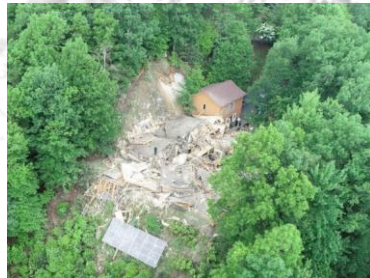
May 30, 2018 – A modified slope failure lead to a propane gas explosion that claimed two lives. (Right)

More information on mitigation of landslide and other natural hazards is available in the High Country Regional Hazard Mitigation Plan Update 2017 .