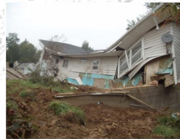
2004 – A modified slope failure at the White Laurel Subdivision resulted in severe damage to numerous structures. (Left)