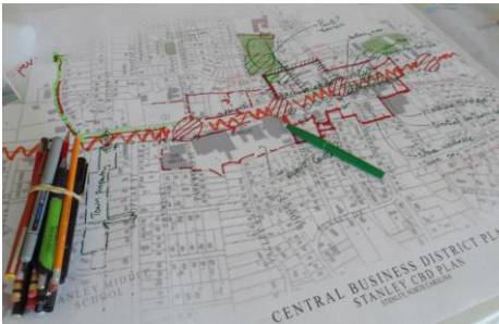
Town of Stanley, NC CBD Master Plan Workshop