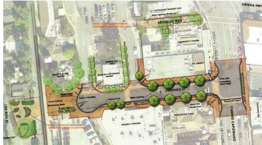
San Juan Capistrano Master Plan

A master plan would incorporate adopted regional plan elements such as transportation improvements, bike plans, greenways and recreational trails. Hazard Mitigation Plan goals and recommendations would be included as well within a single document.