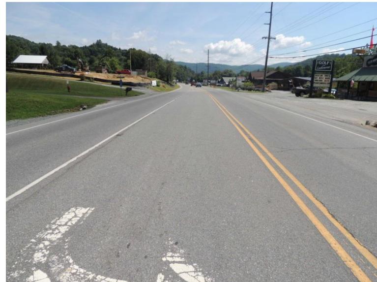
Highway 105 Looking East @ Church Street Intersection