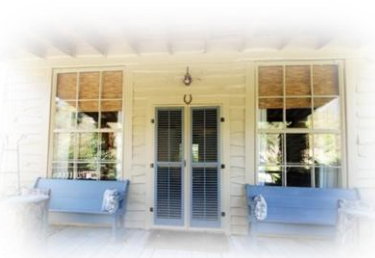
WT 272 - Shulls Mill General Store