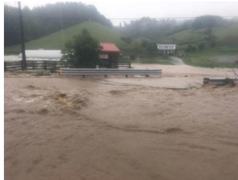
May 18, 2018 – one of several bridges over the Watauga River is over-topped impeding access residents and emergency personnel.