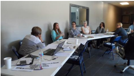
Town of Stanley, NC Citizen Participation