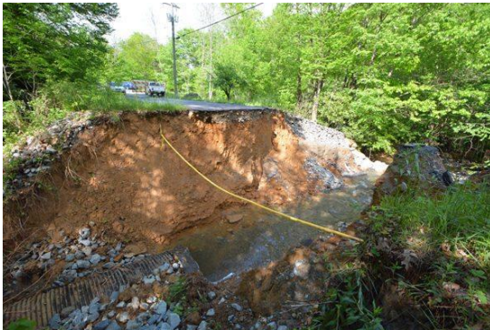
May 18, 2018 – Adams Apple Drive, a private roadway, collapsed leaving 25 homeowners with no access to their property.

The High Country Hazard Mitigation Plan is an extensive regional plan that identifies and profiles a number of natural and human-caused hazards in the area that threaten public health and safety. Natural hazards such as floods, landslides, winter storms, severe thunderstorms, and wildfires have the potential to damage or destroy public and private property, disrupt the economy, and impact quality of life. The region is also susceptible to human-caused hazards, including chemical releases and hazardous material spills. Though we cannot eliminate all hazards, we can lessen the potential impact upon our community and our citizens. By minimizing the impact of multiple hazards upon our built environment, we can prevent such events from resulting in complete disasters. The Hazard Mitigation Plan provides an assessment of community vulnerability to all hazards and recommends mitigation tools and strategies to help prioritize mitigation actions which present the greatest risk to lives and property.